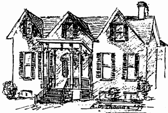
JUSTICE TODD HOUSE BUILT IN 1812. U.S. SUPREME COURT 1807-26. FRANKFORT, KY