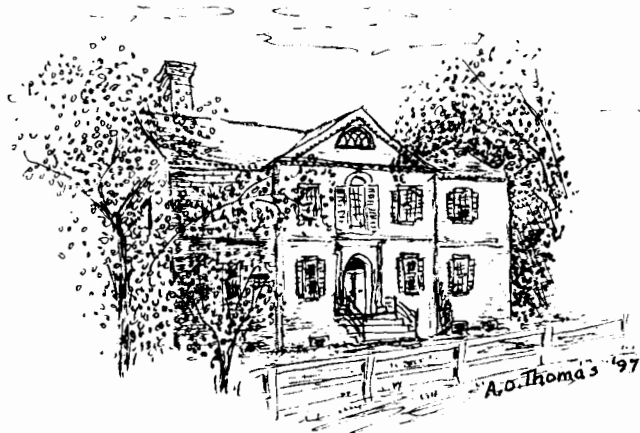
Top..Kentucky State Capitol, Frankfort, Ky Bottom..Liberty Hall, Built by the Honorable John Brown, U.S. Senate 1792--1805 Frankfort, Ky